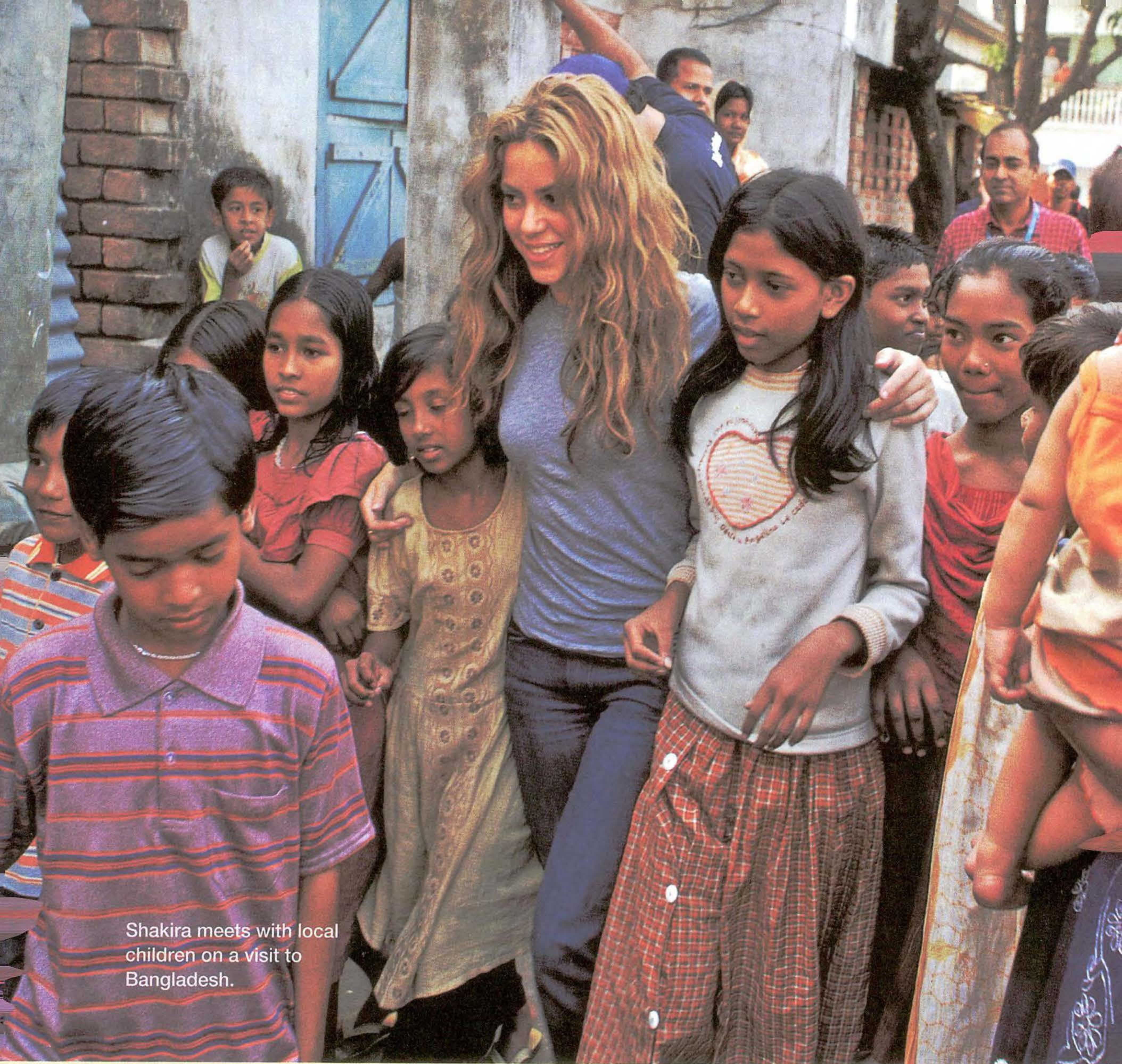
Shakira meets with local children on a visit to Bangladesh.

Bill & Melinda Gates Foundation. The foundation was set up in 1997 and works to improve healthcare , reduce poverty , and increase access to education and information technology worldwide . One of the 50 foundation's primary goals is to eradicate 1 polio worldwide by 2018. The couple practice what they preach , 2 and have traveled to hospitals and remote villages all over the world to help those in need.